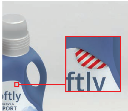
Plastic Container Labeling